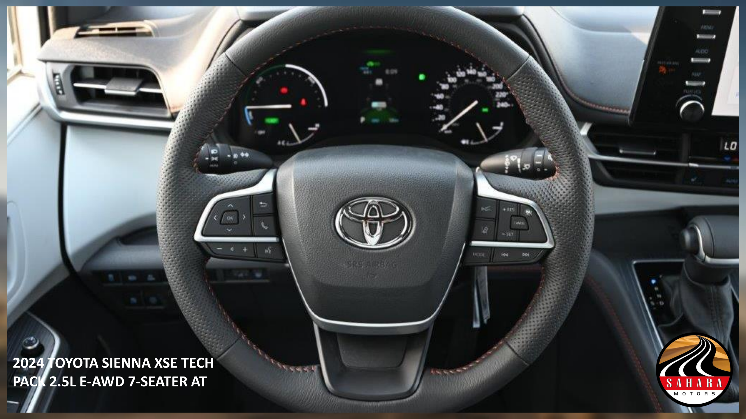
2024 TOYOTA SIENNA XSE TECH PACK 2.5L E-AWD 7-SEATER AT