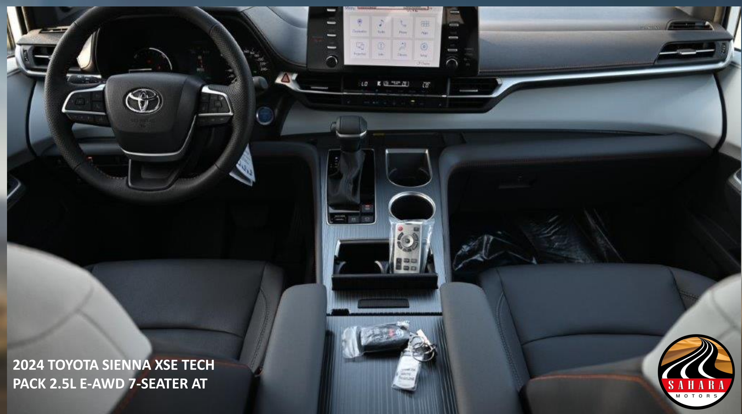
2024 TOYOTA SIENNA XSE TECH PACK 2.5L E-AWD 7-SEATER AT