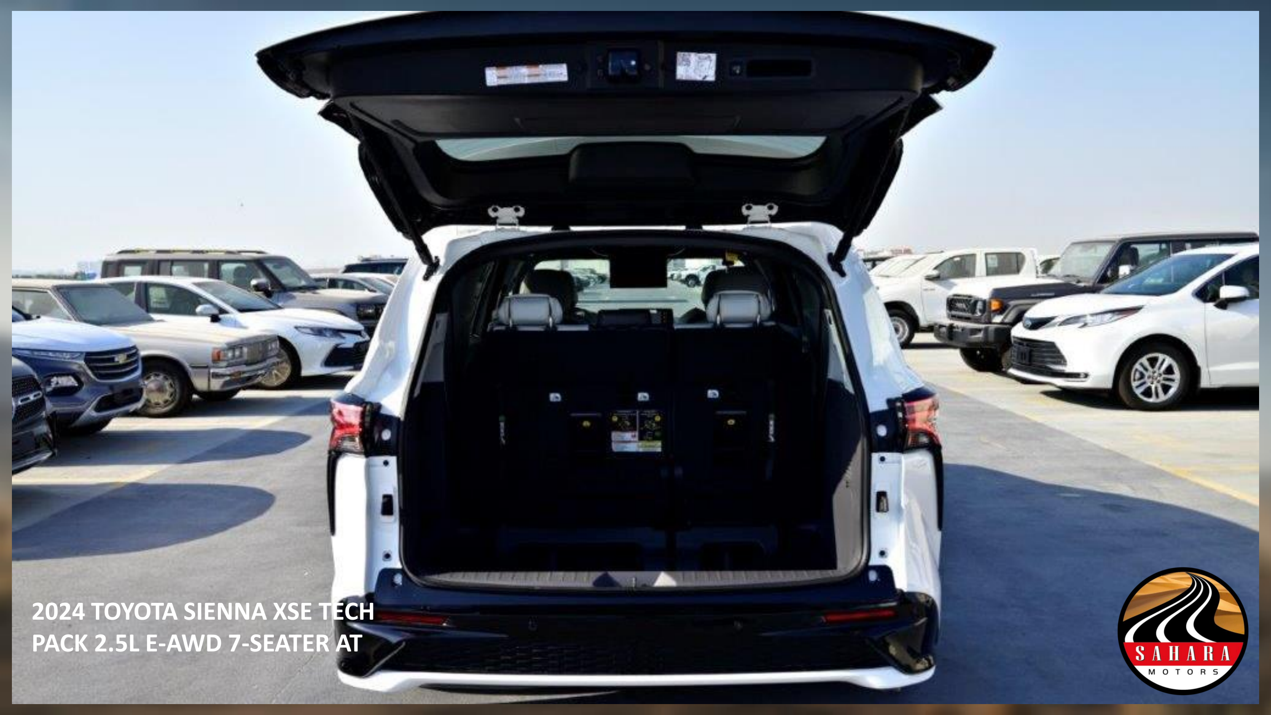
2024 TOYOTA SIENNA XSE TECH PACK 2.5L E-AWD 7-SEATER AT