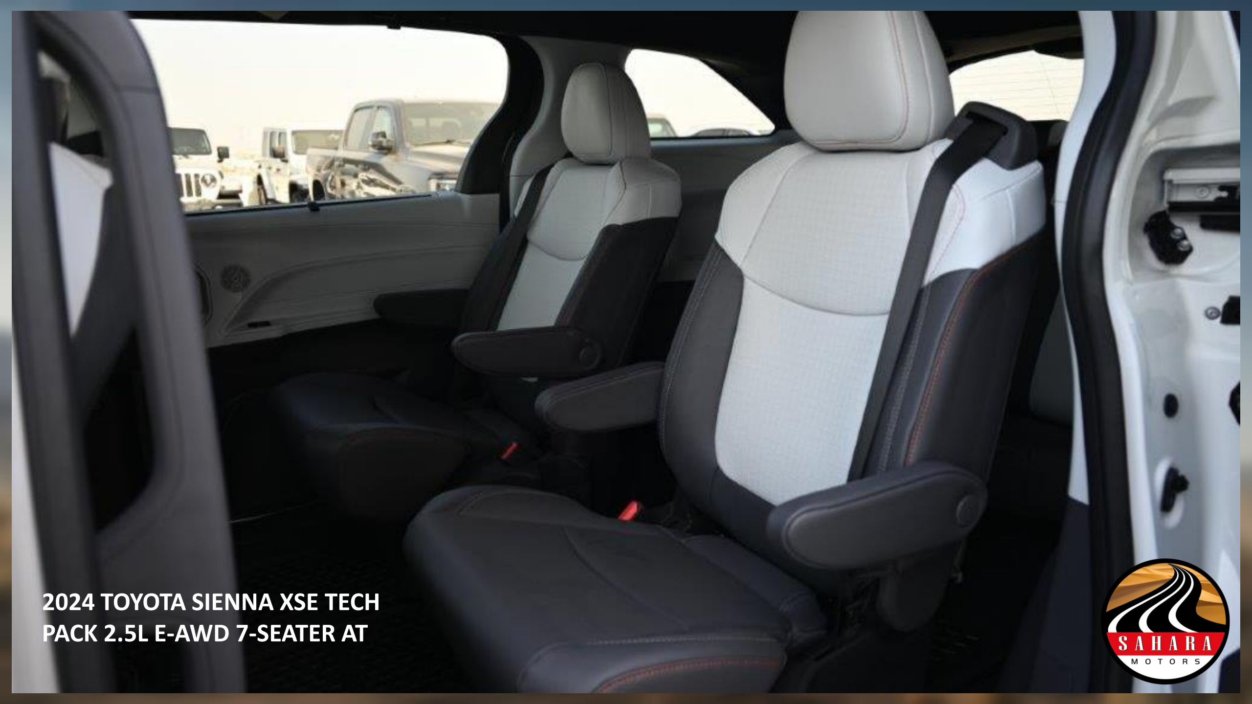
2024 TOYOTA SIENNA XSE TECH PACK 2.5L E-AWD 7-SEATER AT