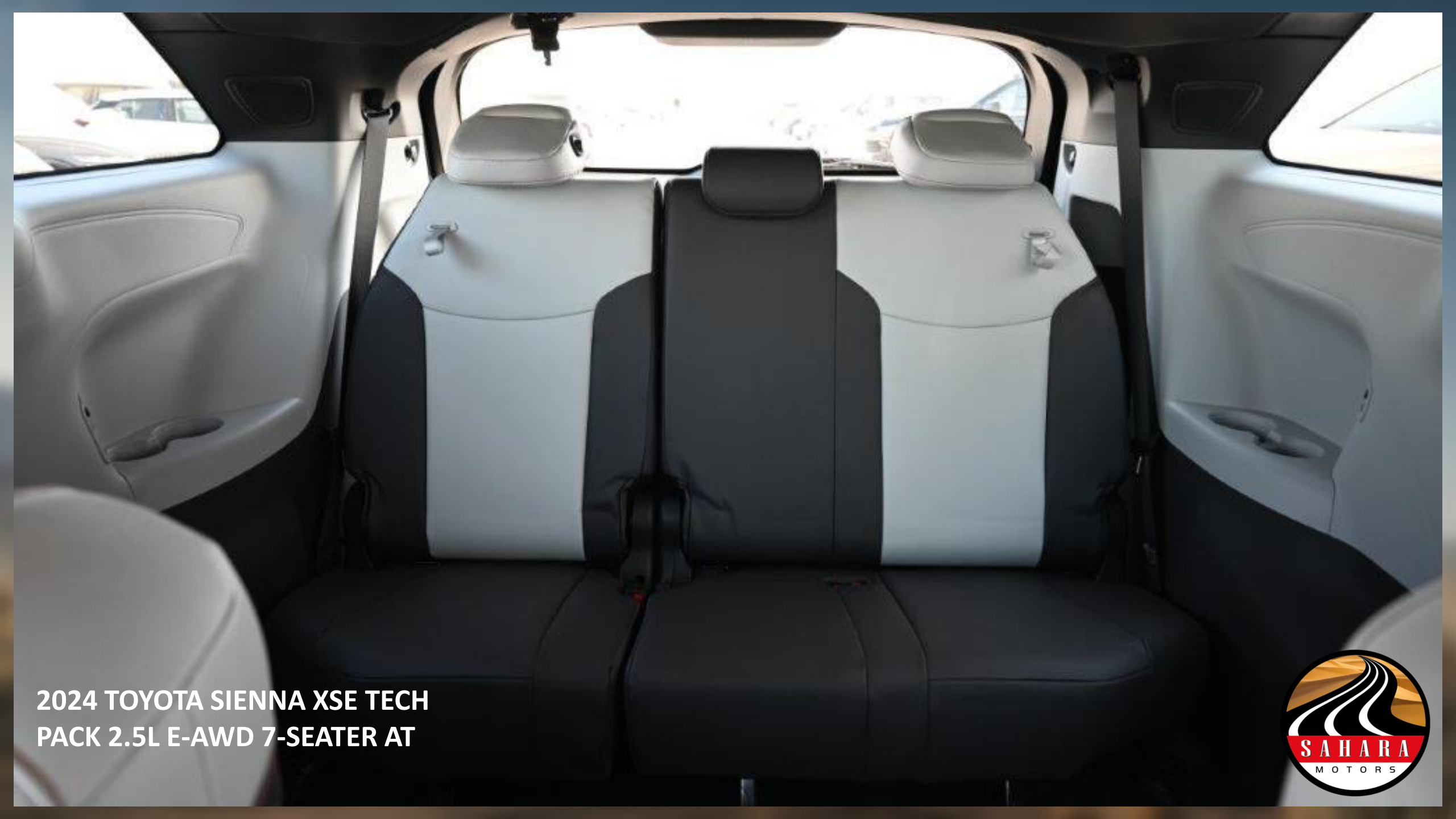
2024 TOYOTA SIENNA XSE TECH PACK 2.5L E-AWD 7-SEATER AT